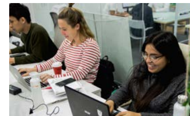
Business, Marketing, & Finance